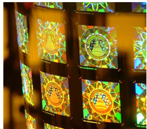
Detail of mould prior to mounting on transparent cylinder

UV light is focused by a cylinder lens in the nip. UV curable lacquer is applied to a substrate material and brought into contact with a transparent mould wound around a cylinder. UV lacquer is cured in the line of focus, the nip, and the microsurface relief is replicated onto the substrate